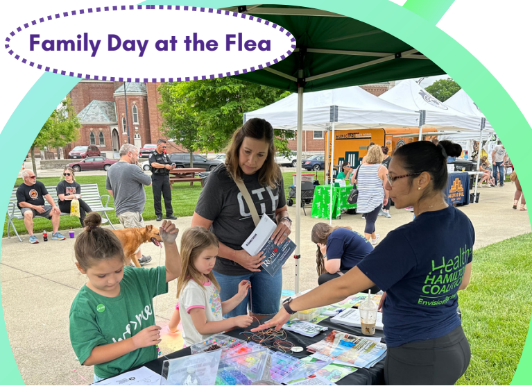
Family Day at the Flea