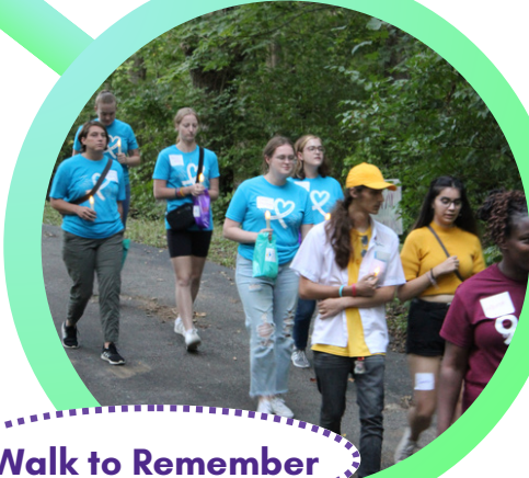
Walk to Remember