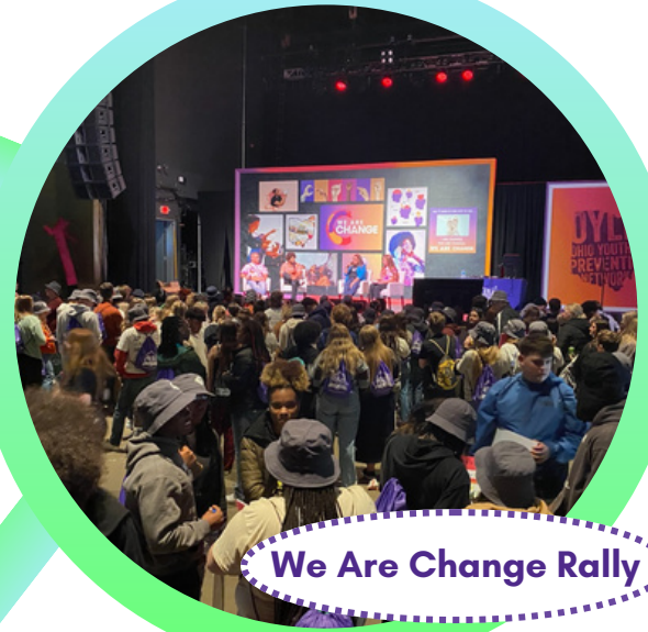
We Are Change Rally